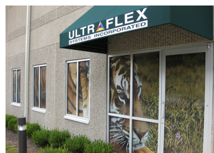
UltraVision® Window Perf UV 6040