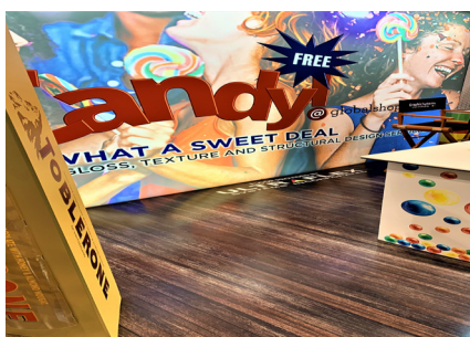
Floorscapes® Clear Media 70 mil